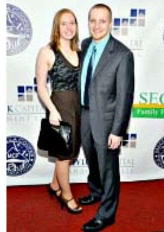
Photo from the MacDella Cooper Foundation's "Fashion Week Finale Party."