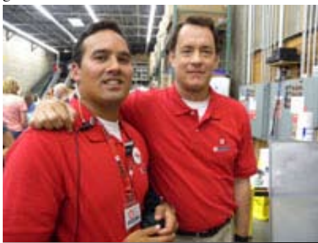
Photo of me on the set of Larry Crowne during our last day of shooting. I almost got added to a scene with Tom.

This past year has been exciting professionally and personally. I've been living and working in Los Angeles for 5 1/2 years. I've been working as a set production assistant on films, TV shows, and commercials. In July 2009 I acquired enough days to become eligible to join the Directors Guild of America. I have been an Assistant Director mainly on Commercials this year, including McDonalds, Target, Direct TV, Harley Davidson and Taco Bell. This year I worked on the films Knight and Day, Larry Crowne, Horrible Bosses, and Battleship. While working on Battleship I shot on location for a month in Oahu. You can always see what I'm up to on IMDB. My professional high light for 2010 would be working on Larry Crowne, whose writer, producer, director and star is Tom Hanks. Also I was the 1st Assistant Director on a Music Video with Nas and Damien Marley "As We Enter", which was a great experience as well because it was the first time I was a First AD on set. I was finally able to take some time off for myself and visited Puerto Rico during July. A month can be a little excessive but I just needed it. I spent most of the time with my grandmother whom I hadn't seen since graduation. It was the vacation of a lifetime.