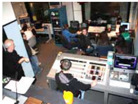
Live production gets the juices flowing

Assisted by J57 and J114 crew members, ten J100 TV Field Photography students produced, live to server with no edits, a half-hour review containing their best reporting. The program aired three times Dec. 8 on The College Channel. Many of the students will help produce and direct DrakeLINE's 12 news magazines during Spring 2011.