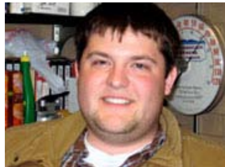
Photo following 3/24 visit with the J173 class.

I'm working at WBAY-TV in Green Bay, WI. I produce the 10 p.m. newscast Monday through Friday. I began looking for other jobs last spring when my contract at KRCC-TV in Redding, CA, was ending. I got a few offers, but decided on WBAY. I started June 14th. It's another 2-year contract, but it's really great here so it's going by quickly. Obviously, I'm a big Packers fan now – I don't really have a choice. I'm excited to be back in the Midwest and the job is great.