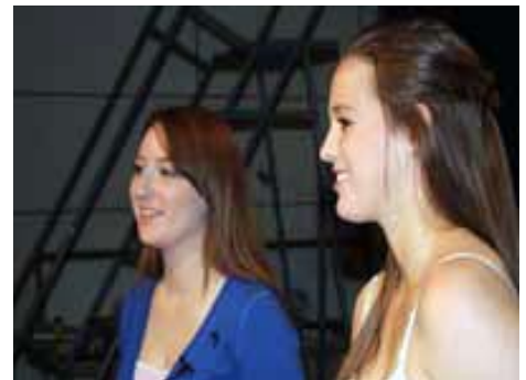
J100 selected two of their own to co-anchor